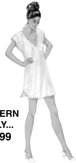
PATTERN ONLY... $8.99