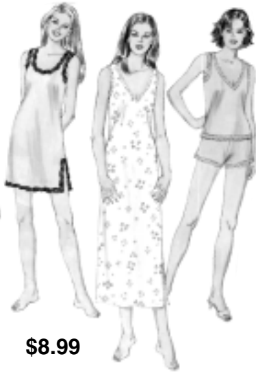
3342 Misses' Gowns & Pajamas Sizes XS-S-M-L-XL For stretch knits only with 25% stretch.