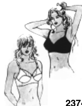
2374 Misses' Bra Sizes: 42-44-46 With Cup Sizes C-D-DD-DDD For Nylon Tricot, Power Net & Lace Pattern Only $8.49