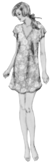
KIT 17 $14.00