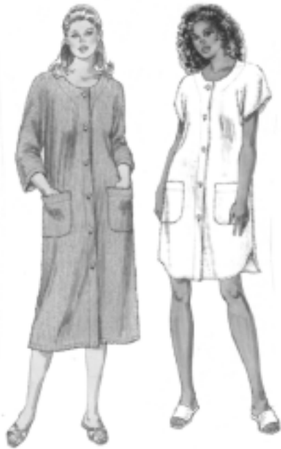
3176 Misses' Robe Sizes XS-S-M-L-XL For Medium to heavy weight fabrics $8.99