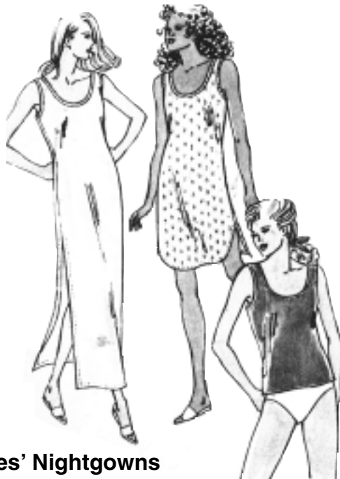
2239 Misses' Nightgowns & Camisole Sizes: XS-S-M-L-XL Designed For Lightweight Woven Fabrics