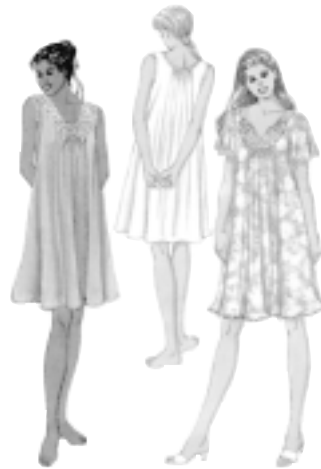
2780 Misses' Nightgowns Sizes: XS-S-M-L-XL For Lightweight Soft Woven and Knit fabric

686 County Road 3053 - Double Springs, AL 35553 205-486-7732