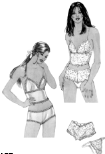
3167 Misses' Camisoles & Panties Sizes: XS-S-M-L-XL Designed For Lightweight Woven Fabrics